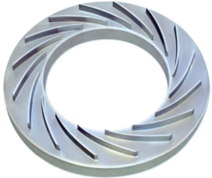
Figure 2. ASTM 304 Stainless Steel diffuser is designed as a drop-in upgrade replacement for existing compressor installations..

Please contact your local authorized FS-Elliott distributor or sales representative for a stainless steel diffuser upgrade proposal for your existing air compressor installation.